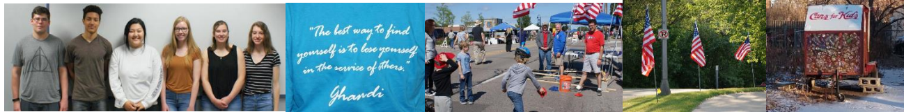
Cans For Kids