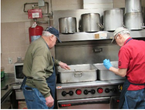
A few pics from 2023 Chili dinner 2/10/2023